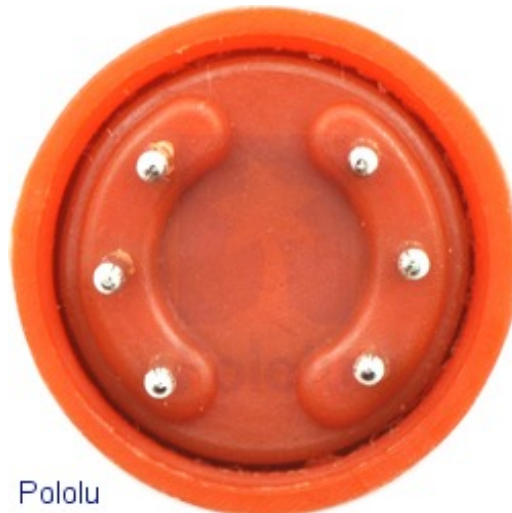
Gas sensor with orange plastic case bottom view.

This Carbon Monoxide (CO) and flammable gas sensor detects the concentrations of CO and combustible gas in the air and outputs its reading as an analog voltage. The sensor can measure concentrations of CO from 10 to 1,000 ppm and flammable gas from 100 to 10,000 ppm. The sensor can operate at temperatures from -10 to 50°C and consumes less than 150 mA at 5 V. Please read the MQ9 datasheet (180k pdf) for more information about the sensor.