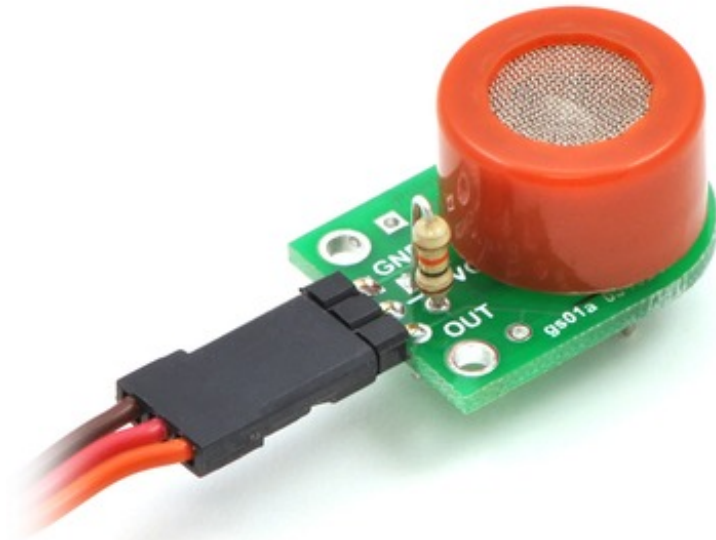
Pololu MQ gas sensor carrier with sensitivity-setting resistor soldered in the vertical orientation.