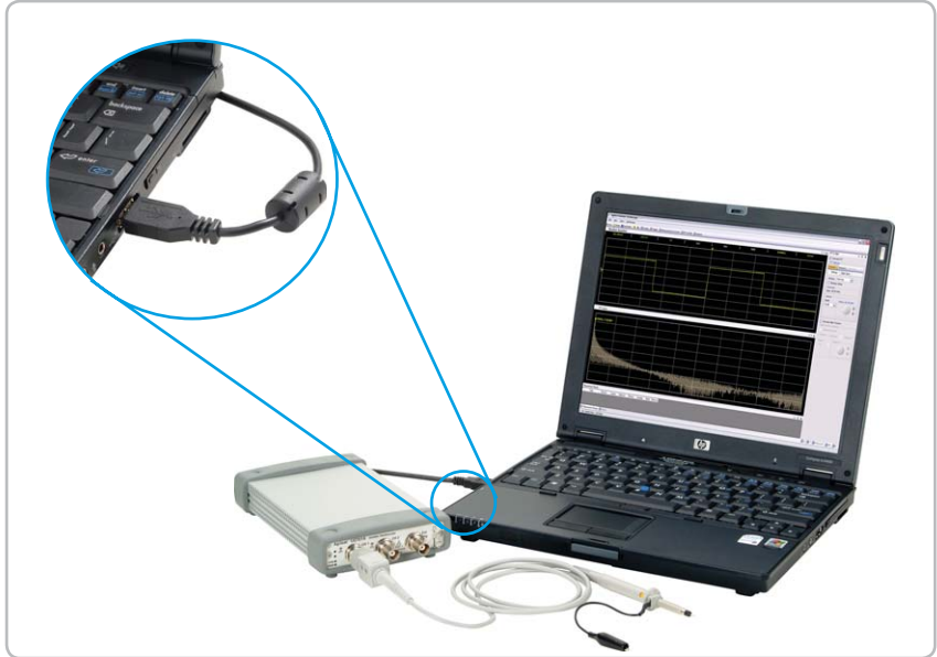
Figure 2. The U2701A and U2702A connect to the computer or laptop with a USB cable, enabling fast data transfer.

The U2701A and U2702A USB modular oscilloscopes offer analysis functions such as addition, subtraction, multiplication, division, and Fast Fourier Transform (FFT). FFT allows you to manipulate the waveform using five types of windows such as Hanning, Hamming, Blackman-Harris, Flattop, and Rectangular.