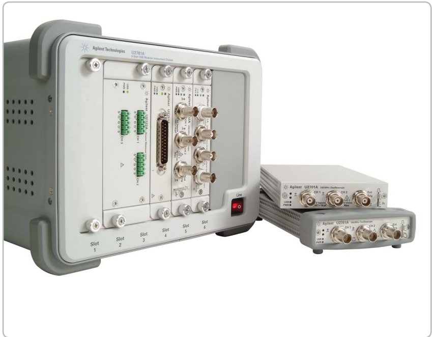
Figure 1. The dual-play capability allows the U2701A/U2702A USB modular oscilloscope to be used as a standalone unit or as part of test system in a cardcage.

The U2701A/U2702A USB modular oscilloscopes are equipped with High-Speed USB 2.0 interface for easy setup and plug-and-play. This ease of use makes the oscilloscopes ideal for the education, design validation and manufacturing industries.