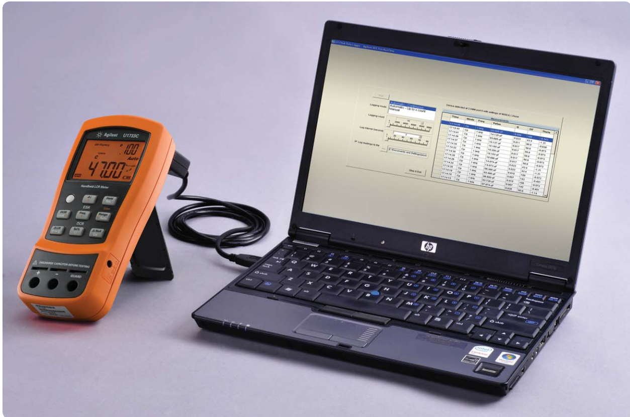
Figure 1. Automate the recording of continuous readings when you hook the U1731C/U1732C/U1733C to a PC

The handheld LCR meters allows you to test various component types, including secondary components of Dissipation Factor (D), Quality Factor (Q), and Angle Indication of Impedance ( \theta ). This new handheld series also includes other functions that result in a more detailed component analysis. For example, the built-in Equivalent Series Resistance (ESR) function helps you better understand the inherent resistance behavior typically found in capacitors across selected frequencies. DCR is a built-in DC resistance measurement that eliminates the use of a separate digital multimeter (DMM) for component test.