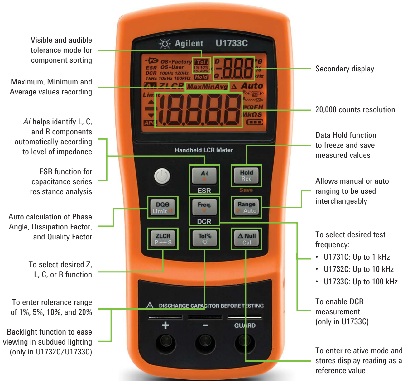
Figure 2. Front view of the U1733C