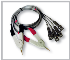
HZ181 4-Terminal Test Fixture with shorting plate (optional)