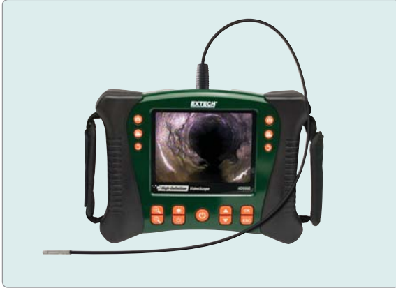
HDV610 VideoScope with 5.5mm diameter flexible probe (1m length)