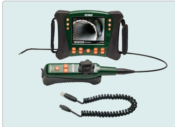
HDV640W VideoScope, wireless handset & 6mm diameter semi-rigid articulated (320°) probe