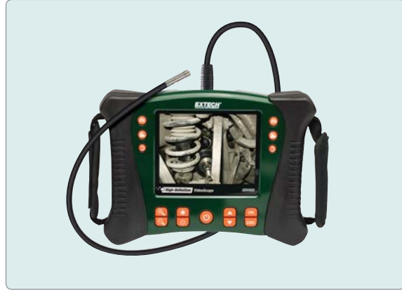
HDV620 VideoScope with 5.8mm diameter semi-rigid probe (1m length)