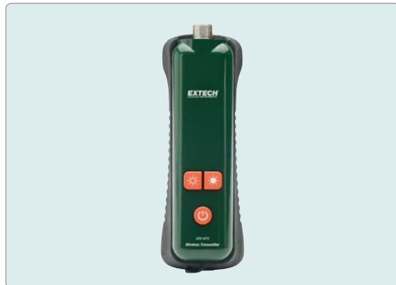
HDV-WTX Universal wireless handset, accepts several scopes of varying diameters, lengths, and flexibility