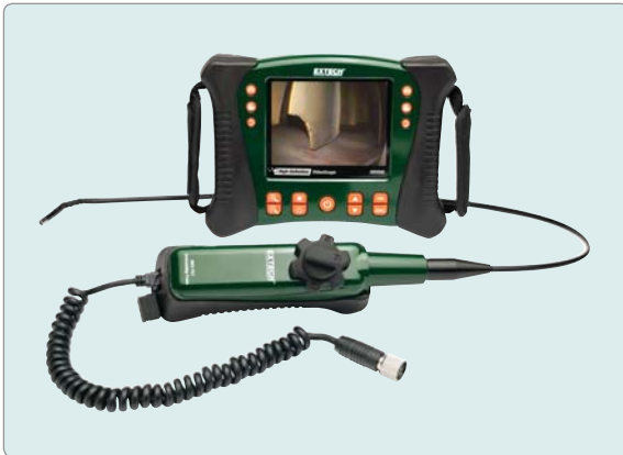
HDV640 VideoScope, wired handset & 6mm diameter semi-rigid articulated (320°) probe